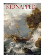
Kidnapped Robert Louis Stevenson