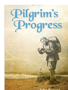
Pilgrim's Progress John Bunyan