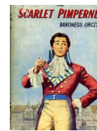
The Scarlet Pimpernel Baroness Orczy