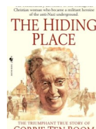
The Hiding Place Corrie Ten Boom