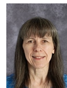
Luba Lee Elementary Aide