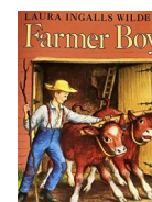
Farmer Boy Laura Ingalls Wilder