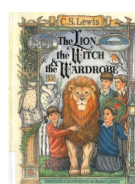
The Lion, the Witch and the Wardrobe C.S. Lewis